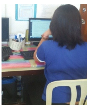
BS Architecture Student doing Grammarly Test

Grammarly is an online platform used by researchers for correct grammar and usage in English. Most of the clients of this program are from graduate school, college and the ripples (student's official publication). The schedule of Grammarly in the research office is from 8:00 in the morning until 5:30 in the afternoon.