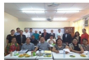
MS Architecture Program Colloquium with the juries