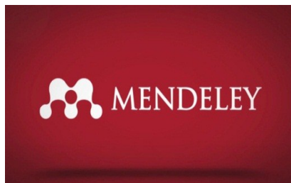
Official Logo of Mendeley

Mendeley is a social reference management tool developed by Elsevier. It is one way of sharing online researches worldwide. It helps researchers find suitable references for their study. It makes the life of a researcher quite easier because it shows citations and the bibliographies related to one's study. It gives the researcher an opportunity to extract metadata automatically from PDF papers. It also allows a researcher to choose a citation style depending on their specification.