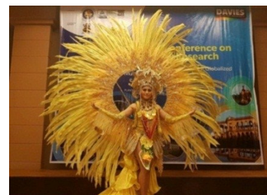
Tourism Student representing Paraguay in the Parade of Nations